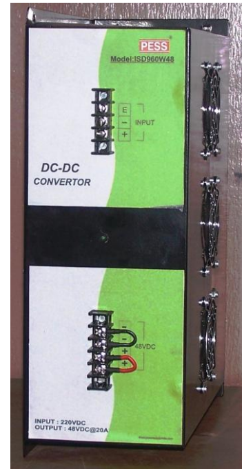
L) Model: 960W48