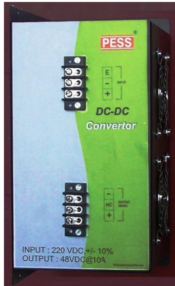
K) Model: ISD480W48