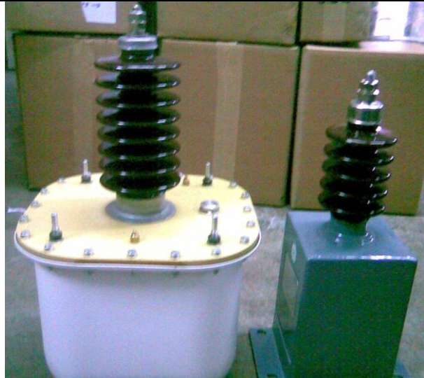
HV Transformer & Capacitor